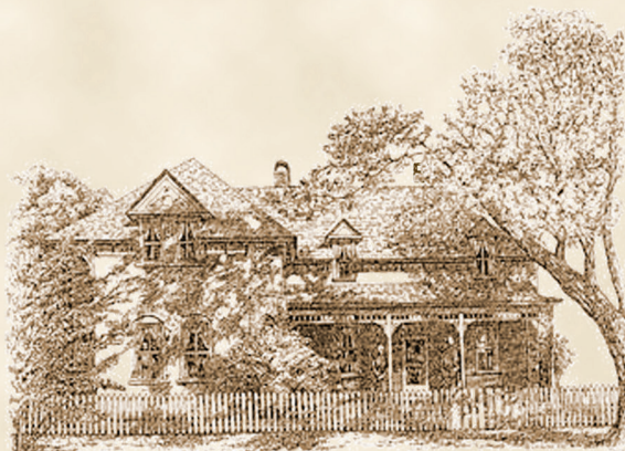
Map & All Images ©Howard Hutchison